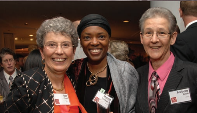
Top: Progressive Martial Arts