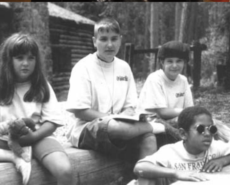
Top: "Lesbians, Money, and Giving" session