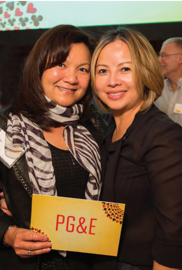
PAGE 18: 2014 Gala Dinner & Casino Party with Advocate Sponsor, PG&E