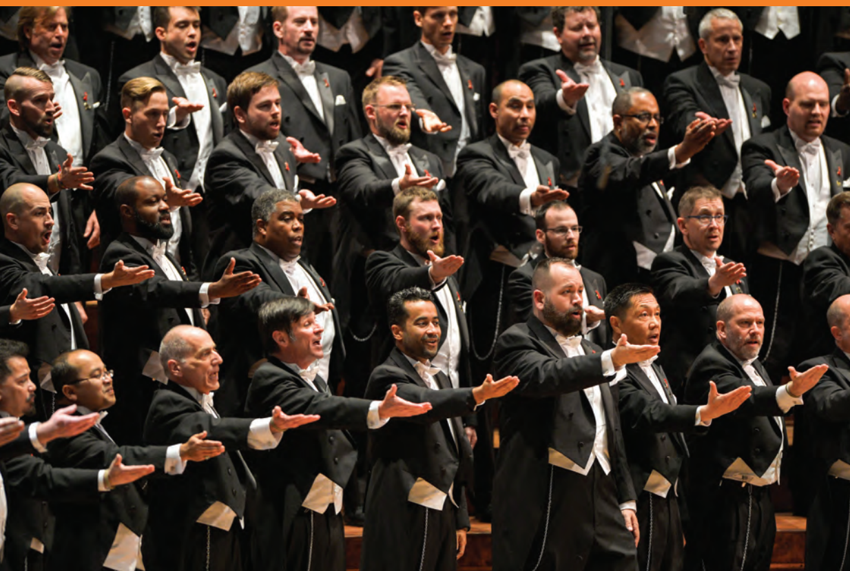
PAGE 6: Queer Women of Color Media Arts Project (QWOCMAP), Horizons' Grantee