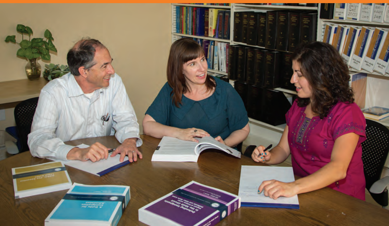
PAGE 8: Our Family Coalition, Horizons' Grantee