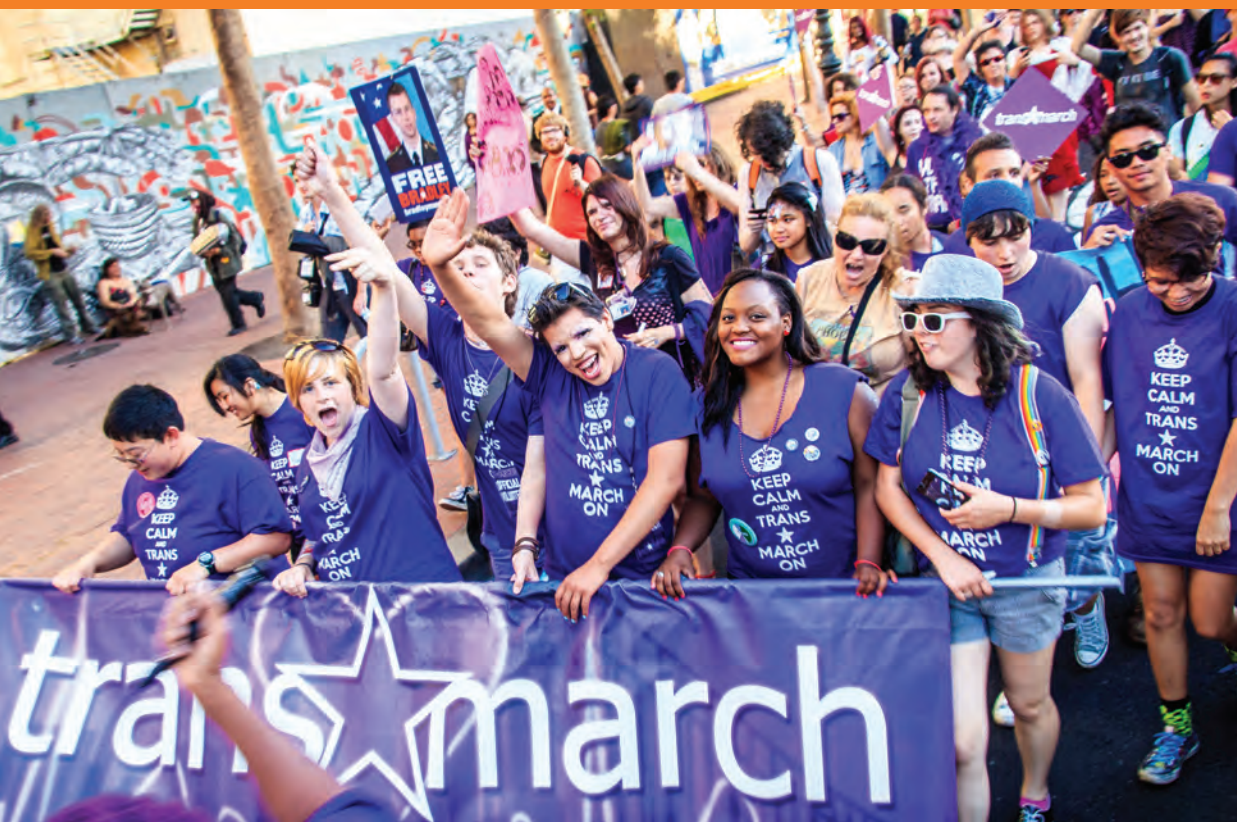
PAGE 2: Somos Familia, Horizons' grantee, at Pride 2014