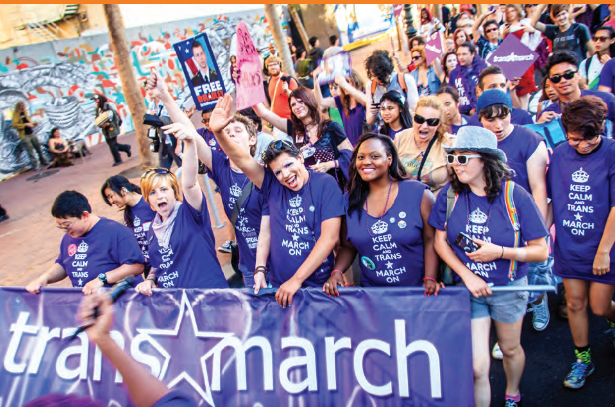
PAGE 2: Somos Familia, Horizons' grantee, at Pride 2014