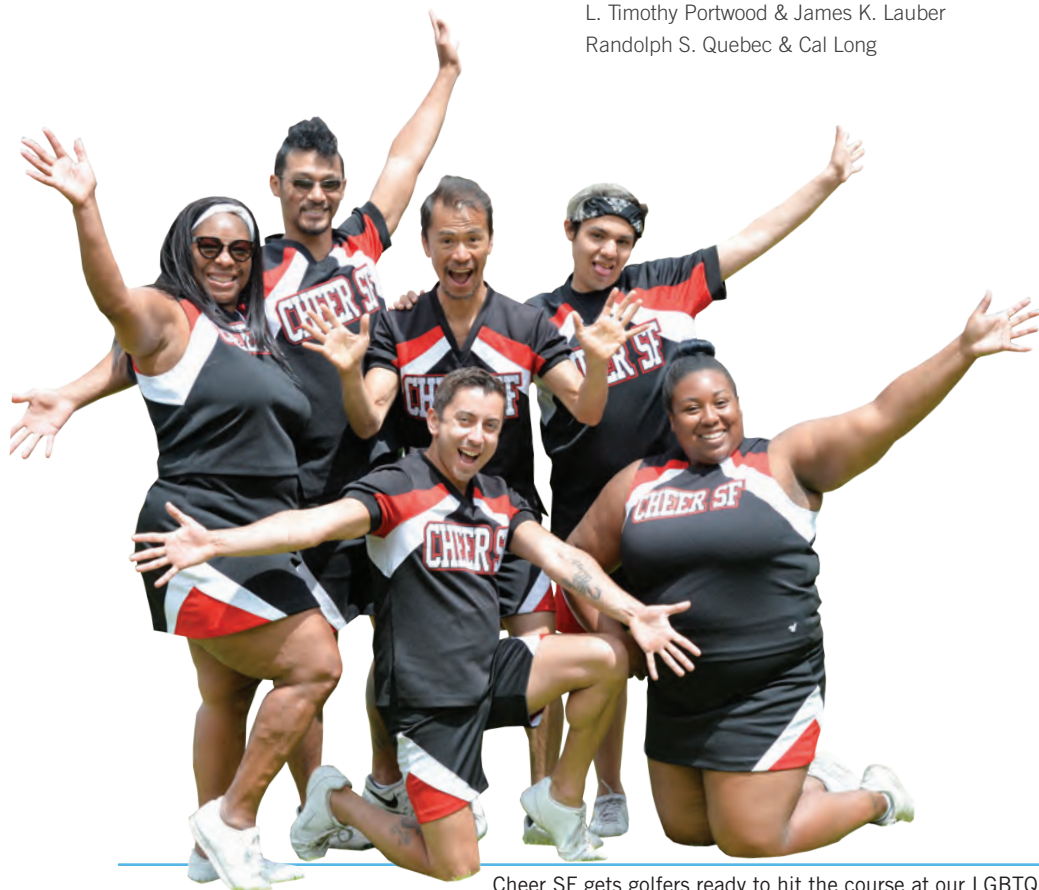
Cheer SF gets golfers ready to hit the course at our LGBTQ Golf Fore Good Women's Tournament!