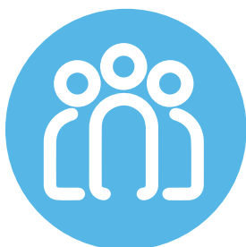
Community Building & Leadership