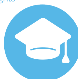
Scholarships & Fellowships