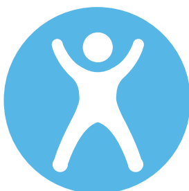
Health & Human Services