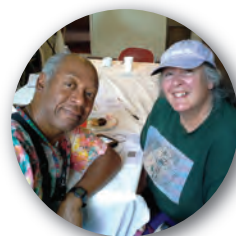
HEALTH & HUMAN SERVICES