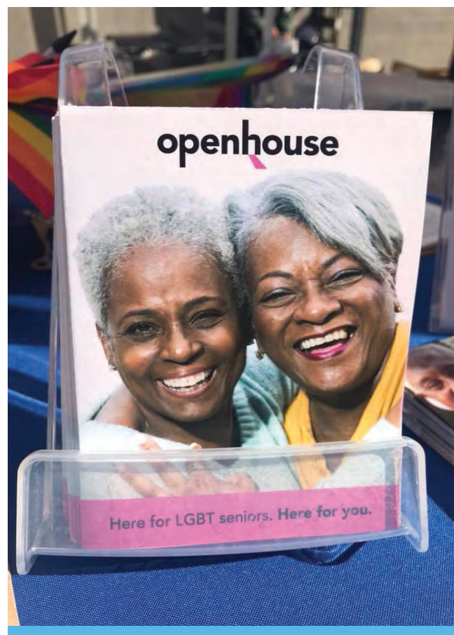
Donor-Advised Fund grantee Openhouse SF