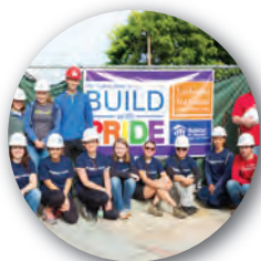
COMMUNITY BUILDING & LEADERSHIP