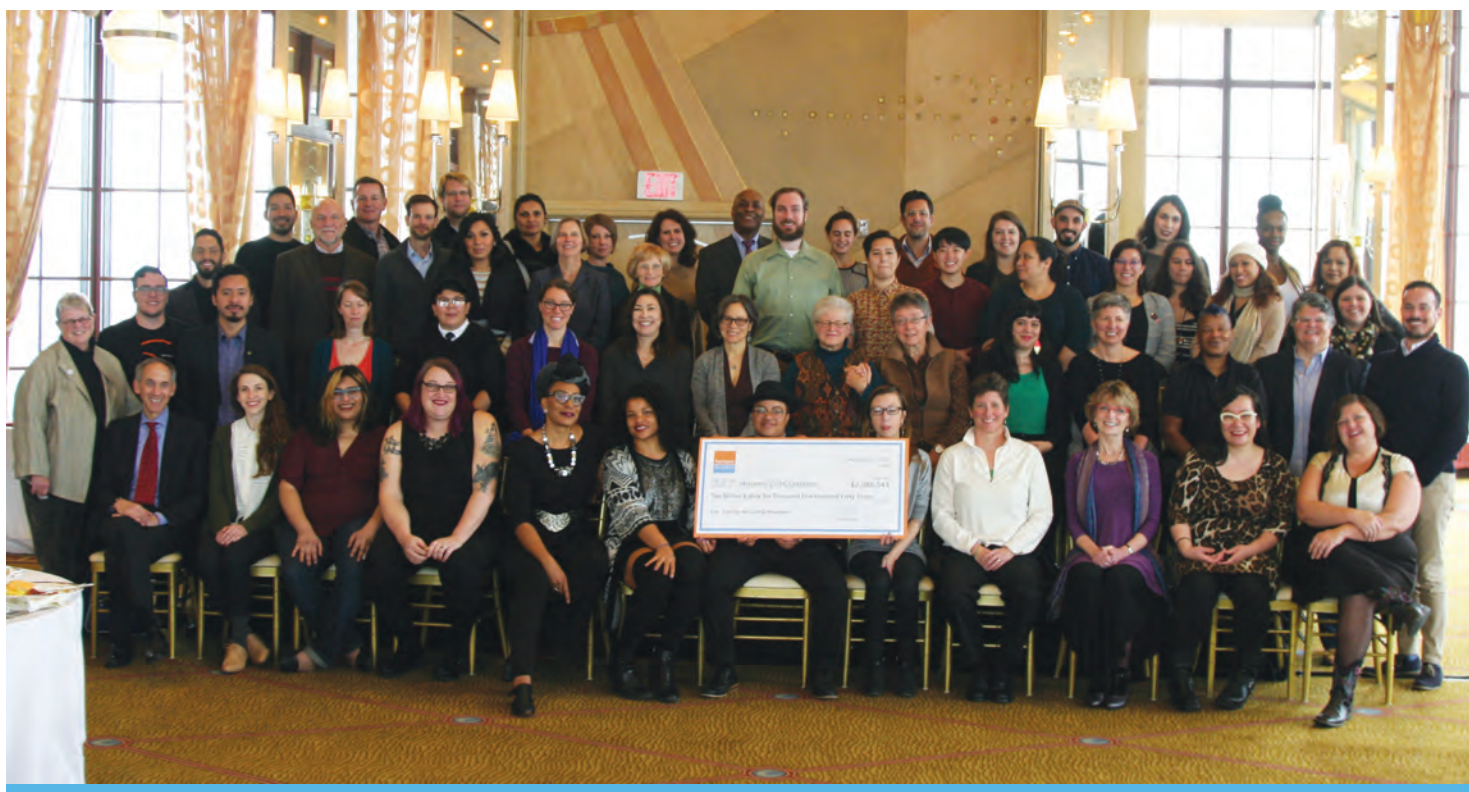
2016 Horizons Foundation Community Issues Grantees