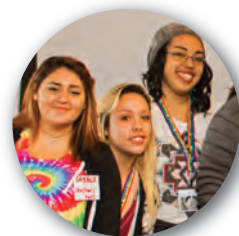
SCHOLARSHIPS & FELLOWSHIPS