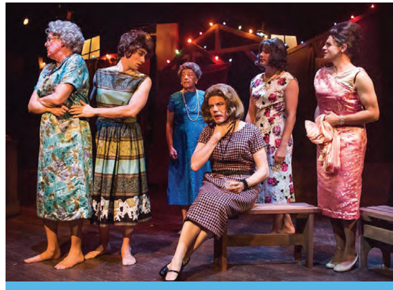
A scene from Casa Valentina at New Conservatory Theater Center