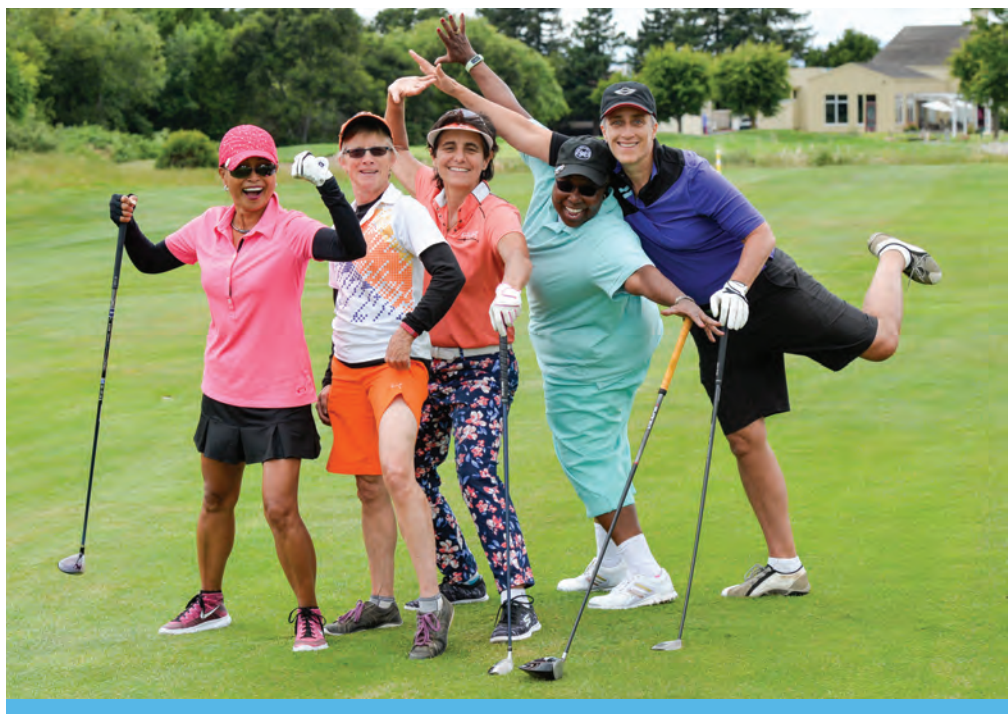
Horizons Foundation's Golf Fore Good