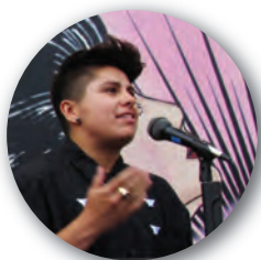
ADVOCACY & CIVIL RIGHTS