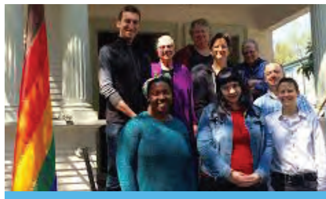
Pacific Center for Human Growth