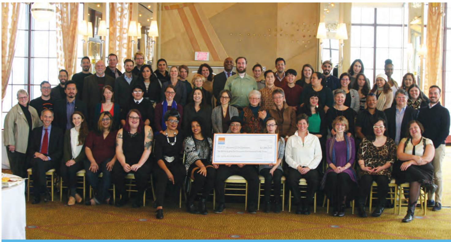
2016 Horizons Foundation Community Issues Grantees