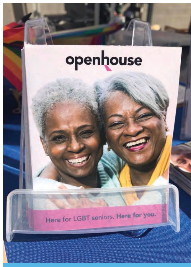
Donor-Advised Fund grantee Openhouse SF