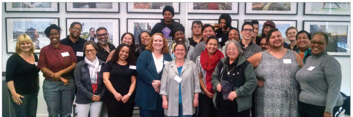
Horizons' Board Leadership Bootcamp.

Volunteer boards of directors play often invisible but vitally important roles in the life of nonprofits. At Horizons' Board Leadership Bootcamp, more than 27 board leaders representing a highly diverse set of 17 grantee partners joined together in a day-long intensive to gain a deeper understanding of how they can make a difference in their organizations. Participants developed core tools for building strong boards, managing conflict, fundraising, and financial management. The training was designed with the goal of giving participants a strong understanding of how to maximize their roles as board members in the areas of governance, strategy, fundraising, and financial oversight.