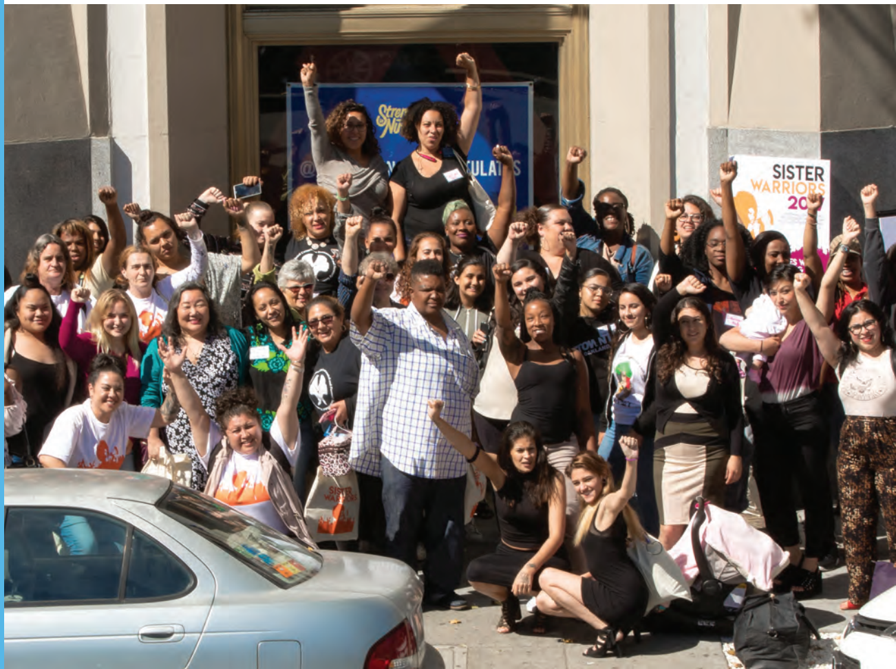
Horizons is proud to support YWFC with a 2017 Community Issues Grant.