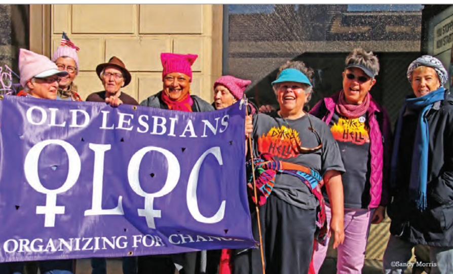
Members of OLOC (Old Lesbians Organizing for Change) at the Women's March