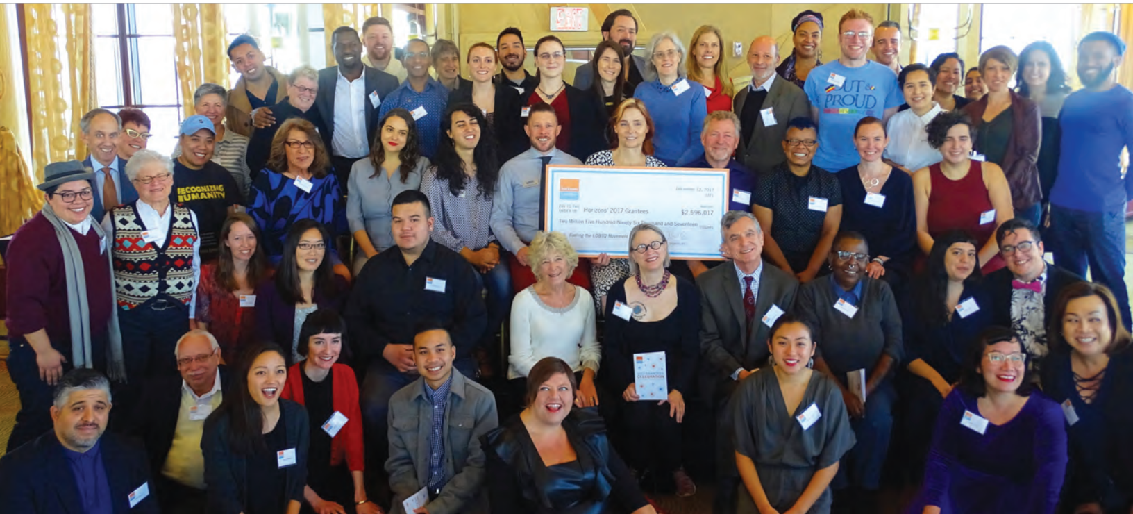
2017 Horizons Foundation Community Issues Grantees.