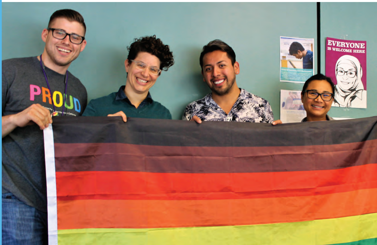
Horizons proudly supports Rainbow Community Center with a 2017 Community Issues Grant.