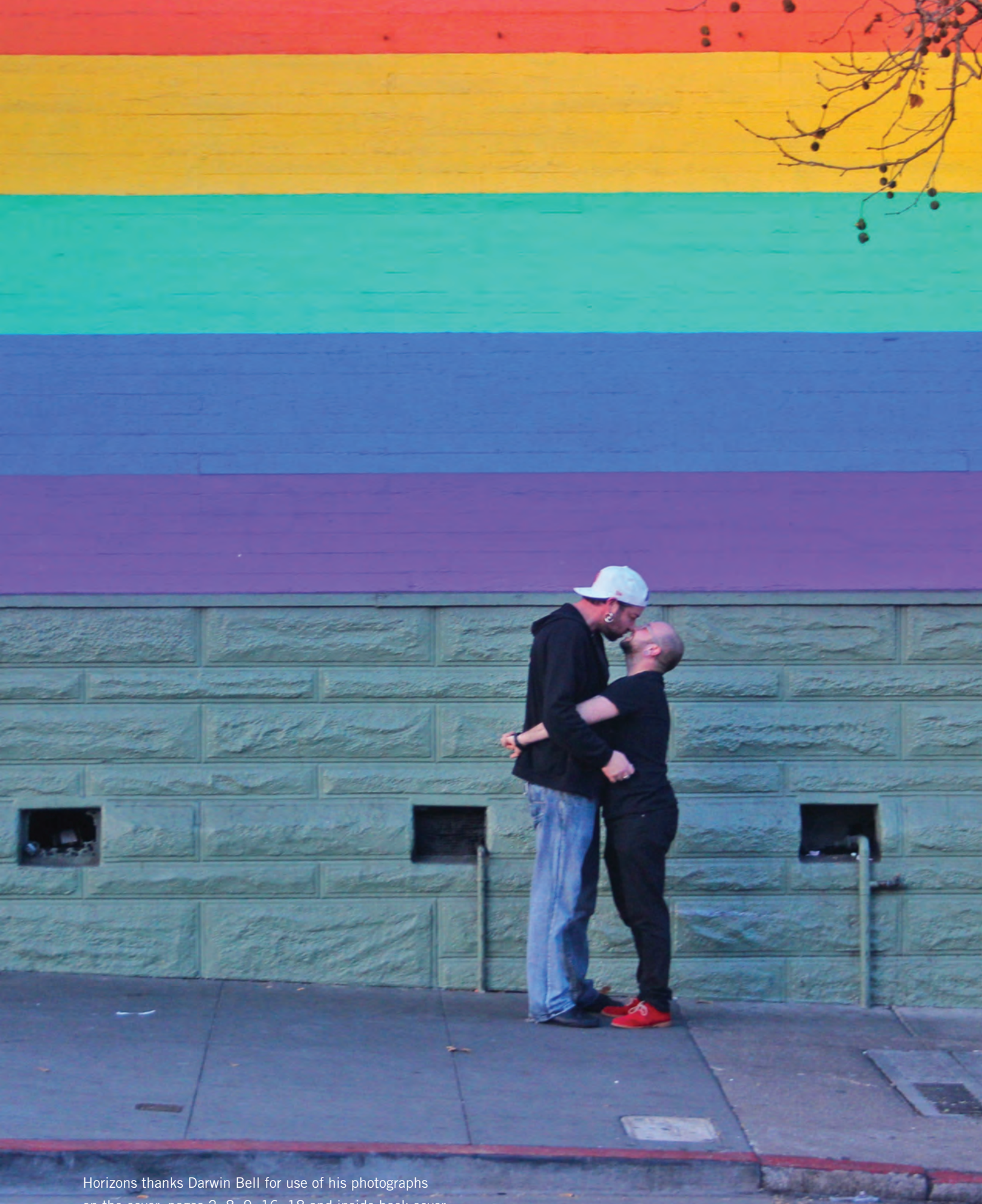
Horizons thanks Darwin Bell for use of his photographs on the cover, pages 2, 8, 9, 16, 18 and inside back cover.