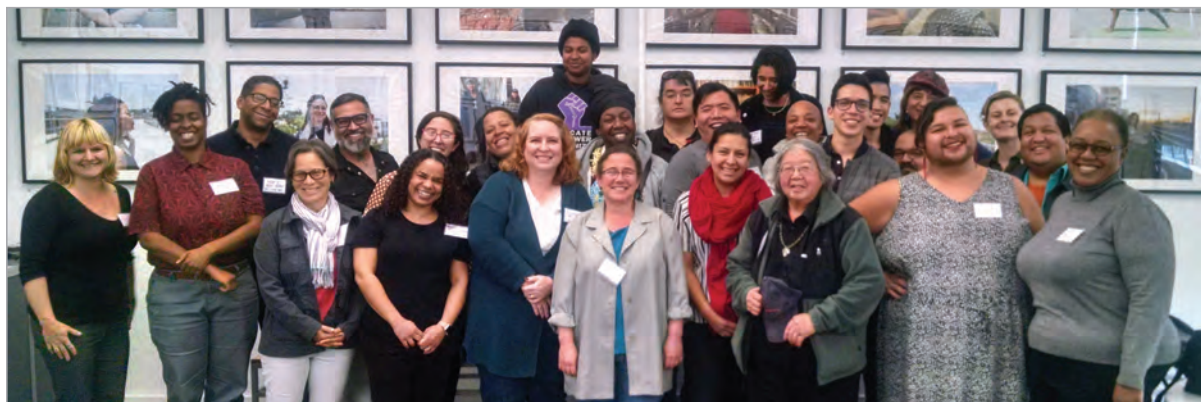
Horizons' Board Leadership Bootcamp.

Volunteer boards of directors play often invisible but vitally important roles in the life of nonprofits. At Horizons' Board Leadership Bootcamp, more than 27 board leaders representing a highly diverse set of 17 grantee partners joined together in a day-long intensive to gain a deeper understanding of how they can make a difference in their organizations. Participants developed core tools for building strong boards, managing conflict, fundraising, and financial management. The training was designed with the goal of giving participants a strong understanding of how to maximize their roles as board members in the areas of governance, strategy, fundraising, and financial oversight.