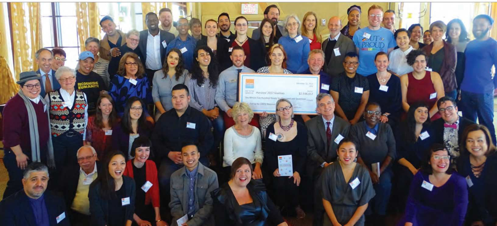
2017 Horizons Foundation Community Issues Grantees.