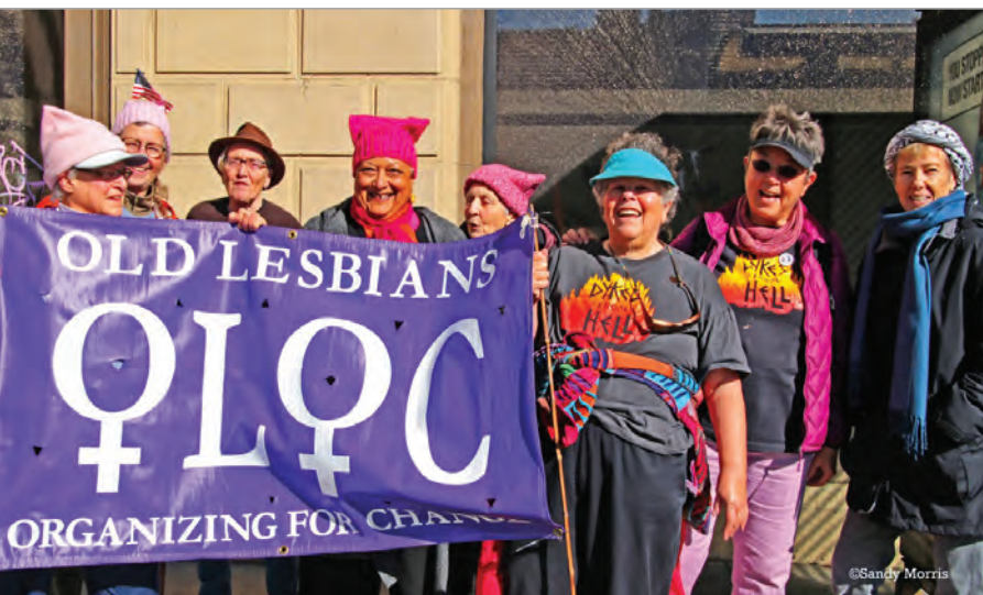
Members of OLOC (Old Lesbians Organizing for Change) at the Women's March